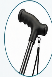
COMFORTABLE HANDLE WITH WRIST STRAP