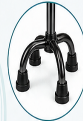
STURDY QUADRIPOD BASE FOR EXTRA SUPPORT